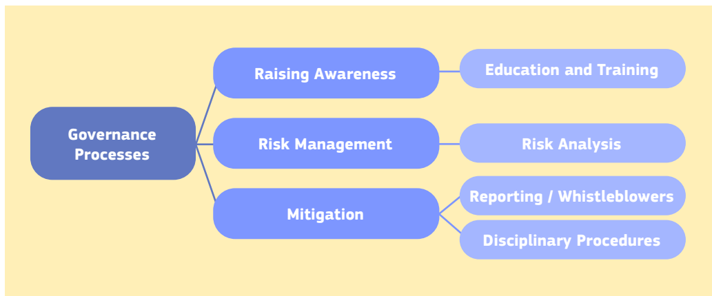
Figure 3.2: Governance processes

The Committee will manage the identification of risks and mitigation measures. These will include those risks that concern core values, international partnerships and security (both infrastructure and cybersecurity). However, these risk studies should only be carried out when the countries involved do pose a potential hazard (see also Chapter 2 and 4 for details). The details of foreign interference for these are detailed in the relevant sections of this document. The Committee will oversee measures to raise awareness of potential threats from foreign interference among staff and students. This will be achieved through education and training as the proactive participation of staff and students will be a core component of identifying risks. This importance of awareness raising and training has already been stressed in the previous chapter on Values. The Committee will provide guidance and oversee measures to ensure smart management of intellectual assets and compliance with intellectual property rules in international cooperations. The FI Committee will also be responsible for investigating cases of potential foreign interference. This may require external expert input especially when dealing with cases of institutional foreign interference. In instances it may be necessary to impose disciplinary procedures, but the focus will be identifying and avoiding potential foreign interference. When assessing risk, it is important that FI Committee safeguards academic freedom.